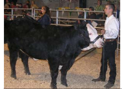
2006 DeSoto County Grand Champion Steer