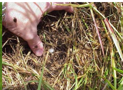
Spittlebugs and Egg Mass