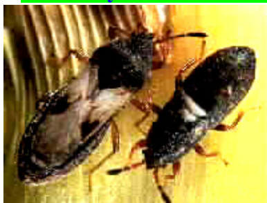
Adult Chinch Bugs