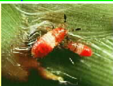
Chinch Bug Nymphs