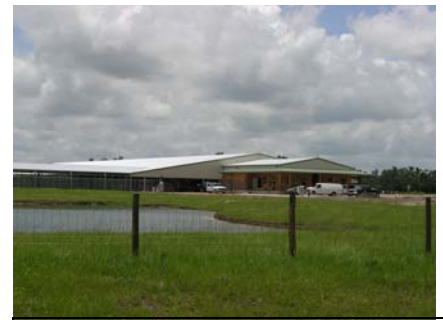
Future Arcadia Stockyards