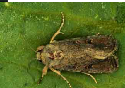
Fall Armyworm Moth